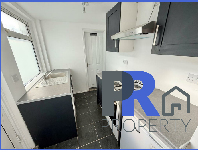
6 Surrey Street, Luton, Bedfordshire, LU1 3BZ £1,250 Per month